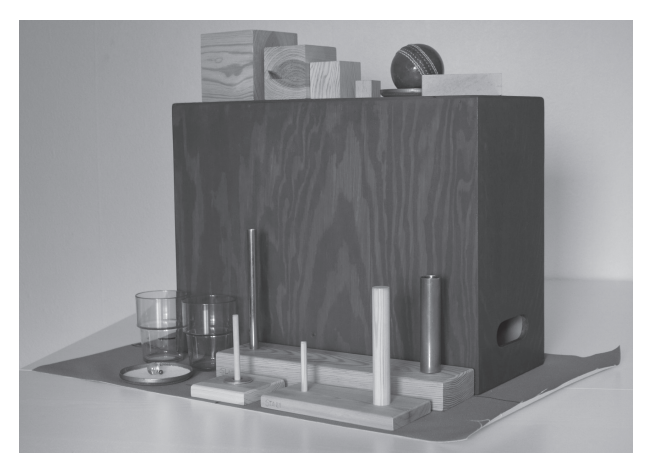
Fig. 1. The Action Research Arm Test (ARAT) test kit.

The ARAT consists of 19 items and a standardized test kit (Sahlgrenska University Hospital, Gothenburg, Sweden) is used (Fig. 1). The person's performance at every item is assessed on a 4-level ordinal scale (0=unable to complete any part of the task within 60 s, 1=the task is partially performed within 60 s, 2=the task is completed but with great difficulty or takes an abnormally long time (5–60 s), or 3=the task is performed normally within 5 s) (7). The ARAT is divided into 4 subtests; grasp (6 items; 0–18 points), grip (4 items; 0–12 points), pinch (6 items; 0–18 points) and gross movement (3 items; 0–9 points). Upper extremity function is assessed unilaterally, starting with the less affected side. Subtest scores are added to calculate a total score for each side, ranging from 0 to 57 points. Each subtest in the ARAT is arranged in a hierarchical order, in which the most difficult item is tested first, followed by the easiest item, then items with gradually increasing difficulty.