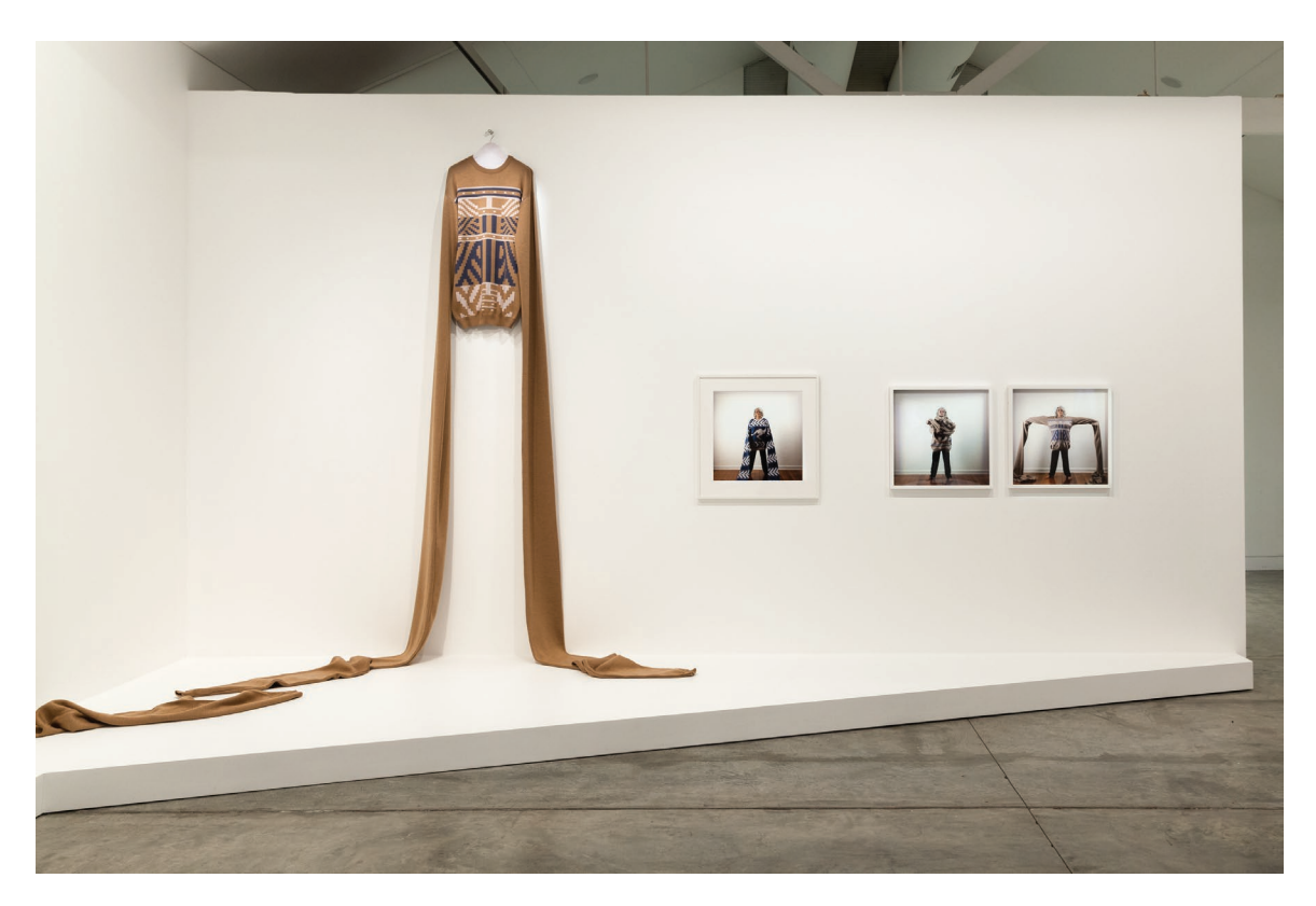
Figure 4 Collection+: Christian Thompson. Installation view, Sherman Contemporary Art Foundation, 2015.

and orchestrated settings," alongside several video works that use Thompson's father's language of the Bidjara people (Figure 5).