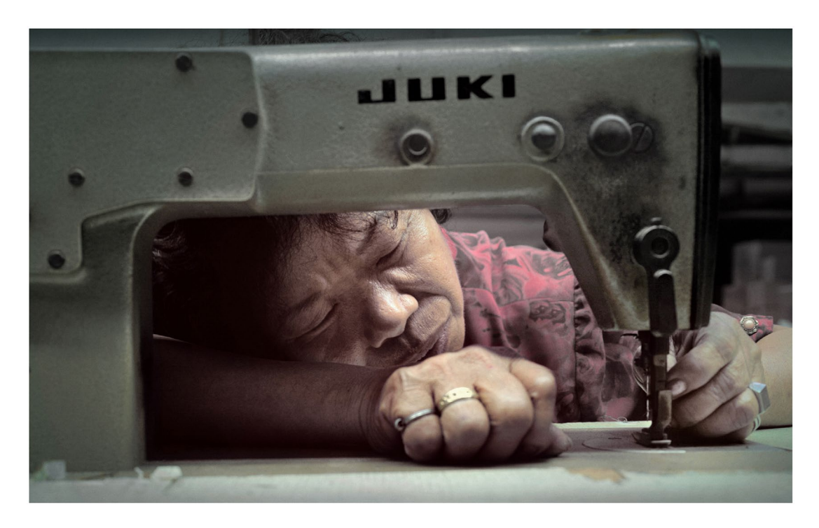
Figure 4 Factory, Chen Chieh-Jen, 2003, film and still images.

A thought-provoking aspect of the second Triennial was the number of artists who consider the themes of factory closure and loss of work. The topic is of course familiar across Europe and North America, but in my experience China often receives our blame as the place where manufacturing which has vanished from Europe has now moved. To find a number of Chinese and a Taiwanese artist also dwelling on local textile factory closures and obsolete industrial machinery was a sobering perspective to see.