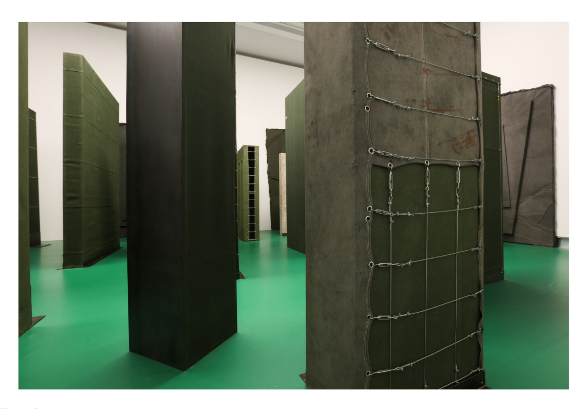
Figure 5 Green Land, Liu Wei, 2016 installation.

oppressive green canvas walls of Liu Wei's Green Land (Figure 5). Enormous, wrapped shapes evoke a distinctly military atmosphere, heightened by the audio and smoke drifting from Xu Jiang and Yuan Liujun's installation next door. However, also included in