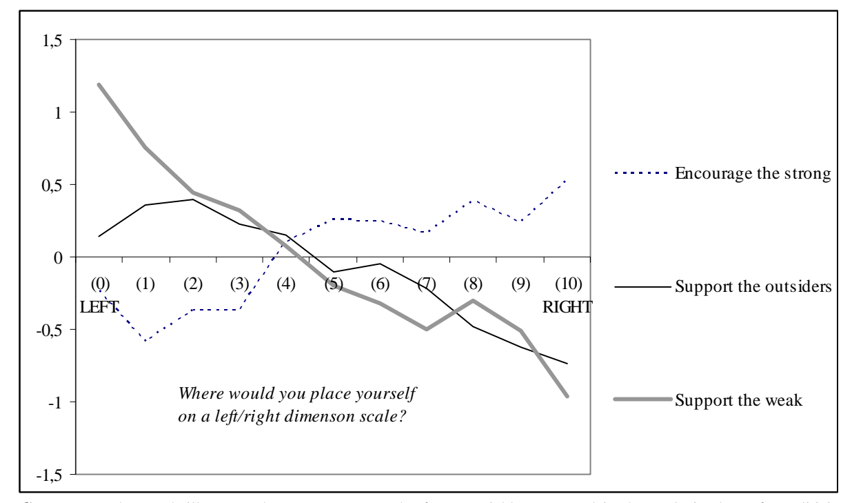
Figure2: Left/right position and solidarity focus

The Swedish party system is heavily based on the left/right-scale and when we add party membership to this model the variance explained is only moderately raised. In the S-dimension, "encourage the strong", party membership add a little more to the model (15 percent with party membership included in the model, 8 percent with subjective left/right position only). The explanation here is that the Centre party traditionally has especially strong ties to the agricultural sector, and support of famers and people in scarcely populated areas are some of their main political aims.